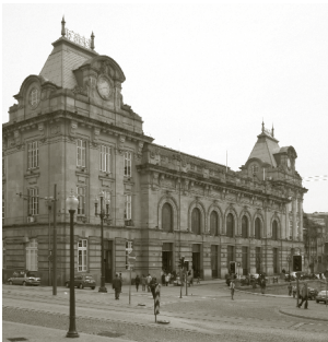
1. S. Bento Railway Station 1896-1916, Praça de Almeida Garrett

Duration > 1h30 Departure > Carmo Tram Stop • 10h30 and 15h00 Contact > 226 158 185