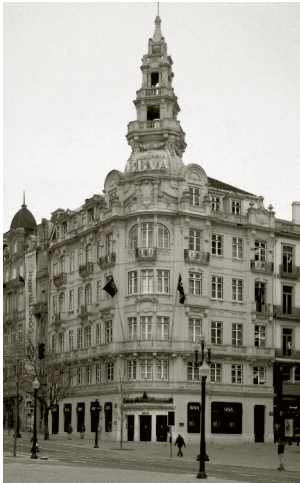
4. Joaquim Emilio Pinto Leite Building 1922, Avenida dos Aliados, 2