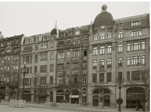
5. Headquarters of the Jornal de Notícias newspaper 1925-27, Avenida dos Aliados, 138-168