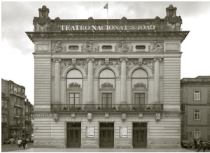
2. S. João Theatre 1909-1920, Praça da Batalha