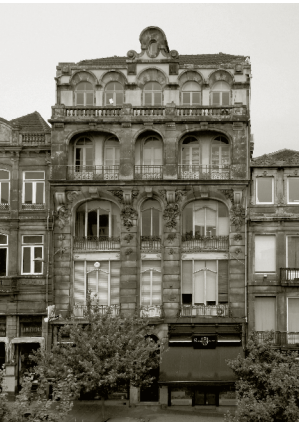
7. Four Seasons Building 1905, Rua das Carmelitas, 100