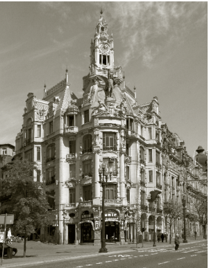
6. The Nacional Insurance Company Building 1919-25, Avenida dos Aliados, 1