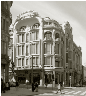
3. Nascimento Department Store 1914-1927, Rua de Santa Catarina, 563/Rua Passos Manuel