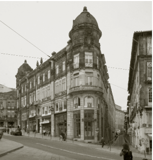
8. Conde de Vizela Palace 1917-1923, Rua das Carmelitas/Rua Conde de Vizela/Rua Cândido dos Reis